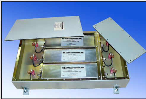
Multi line filters installed in a cabinet

LCR Electronics EMI filter capabilities can help your products meet all requirements and achieve "Mission Success" in the ultimate application. We are a uniquely integrated company for advanced design, engineering, manufacturing, testing and technical support.